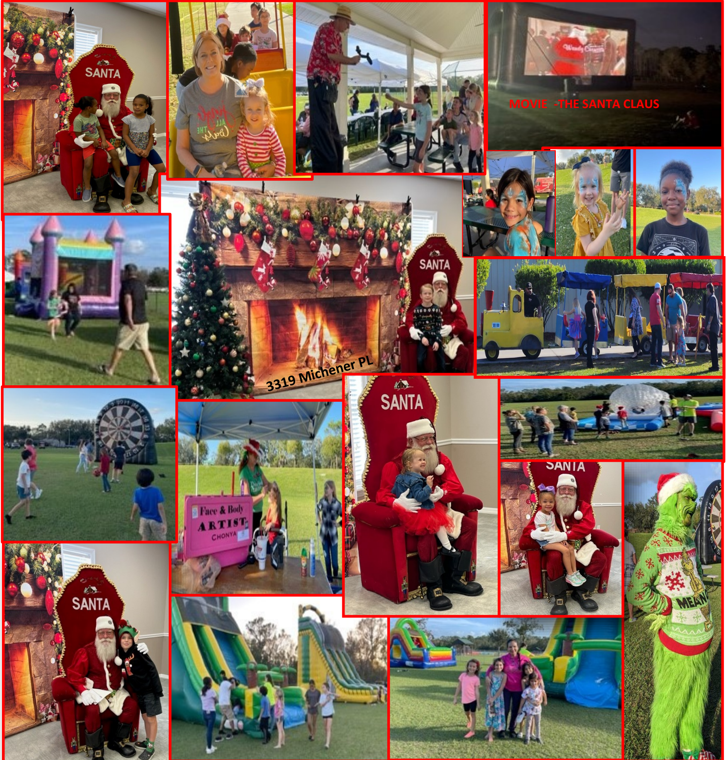
MOVIE -THE SANTA CLAUS