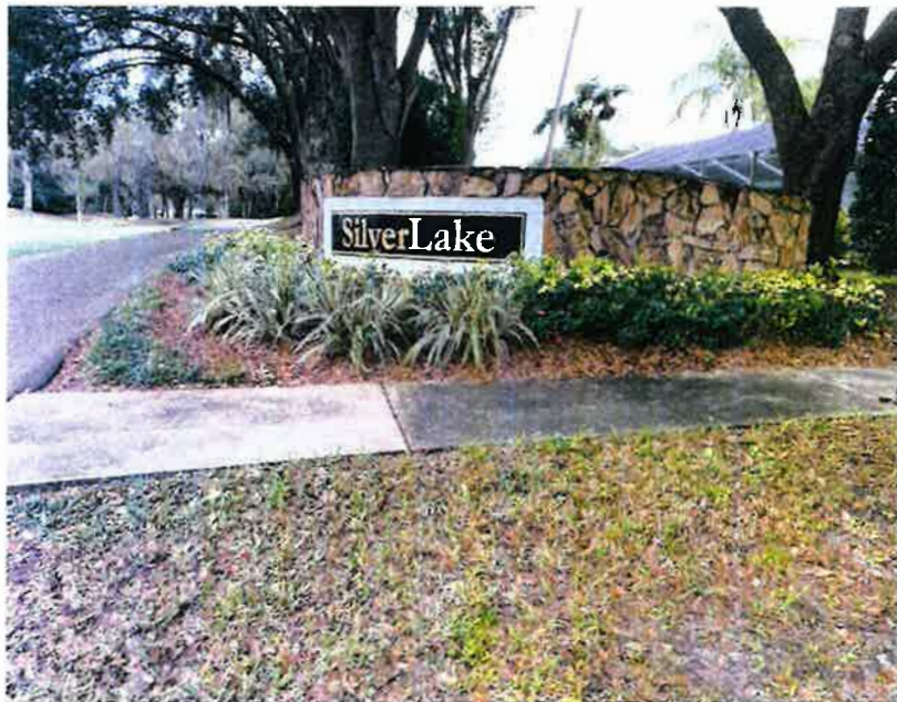
Left Side coming into community