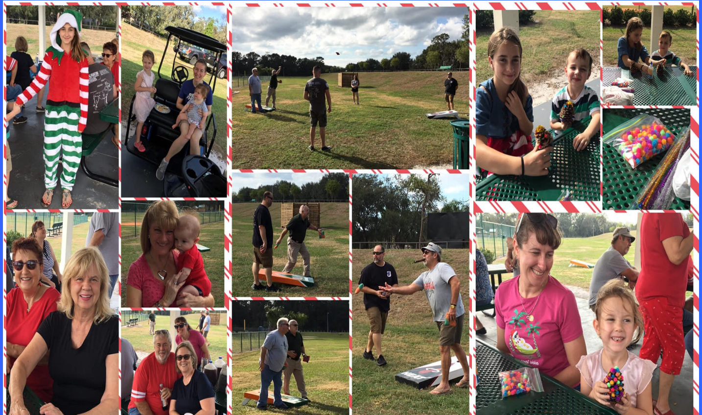
DOG PARK MEMBERS ENJOYING A CHRISTMAS PARTY AT THE SPORTS COMPLEX.