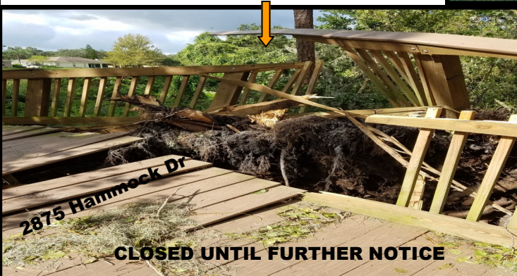
Bridge on path behind Spring Meadow

Also, The City of Plant City has done a great job picking up debris in a timely manner and will continue to do so.