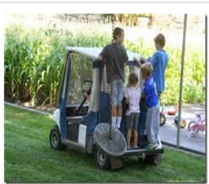
AN ACCIDENT WAITING TO HAPPEN?