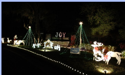
Clubhouse Woods *