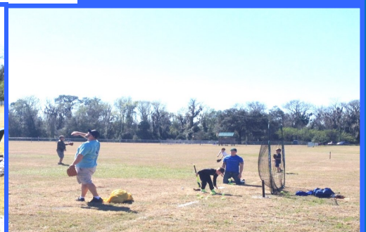
3327 Silvermoon Dr.