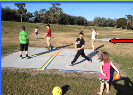
A game of Four Square